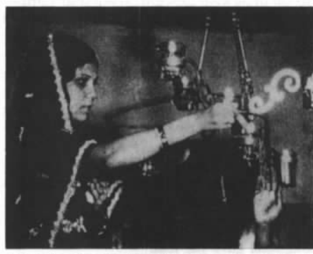
Preparing for the Mendhi Ceremony of Cochin before a wedding.