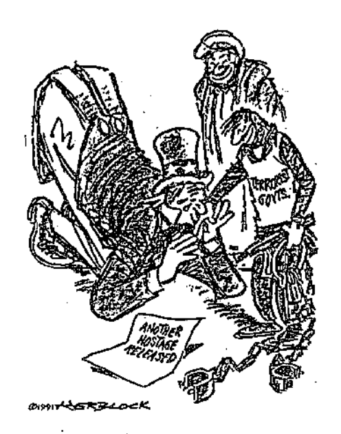
'Oh, God Bless You, Sirs -- Thank You, Thank You, Thank You'

8) I am not familiar with the Haggadot you refer to which attempt to gloss over the word Motzi - but I think that it is quite plain on page 90 of The Sephardi Haggadah that it is understood to refer - as you say - to the blessing for bread; so we are in agreement on this