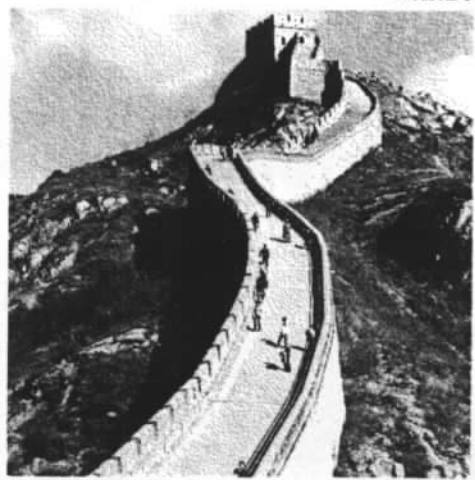
The Great Wall. The only structure visible from the moon.

The continuing rift and hostility between the Iraqi and Syrian regimes may be convenient to Israel while they last. But this is another instance where a sudden change of regime in either or both countries can transform the balance of power in the Middle East and pose a serious threat to Israel's survival N.E.D.