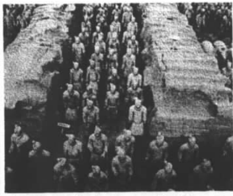
The Terracotta Army, recently discovered near the tomb of China's first emperor, Qin Shi Huangdi.

Xi'an, ancient capital of China and starting point of the Silk Road. It is surrounded by a perfectly preserved massive wall - some 20 metres wide at the top, with several gates and a moat - a rare example of how medieval towns were defended. We also saw there the famous terracotta army of the Chin dynasty. Xi'an has today 60,000 Moslems and while we were there they demonstrated against a book, called Sex Customs which, they claimed, insulted Islam.