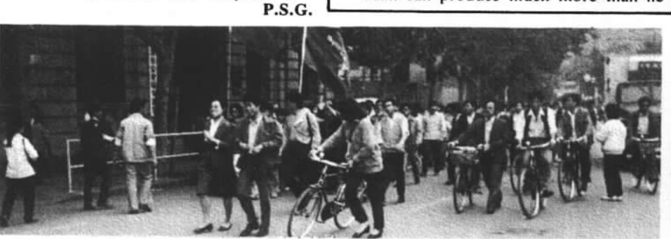
Student demonstration in Shanghai. Some were 8 years old.